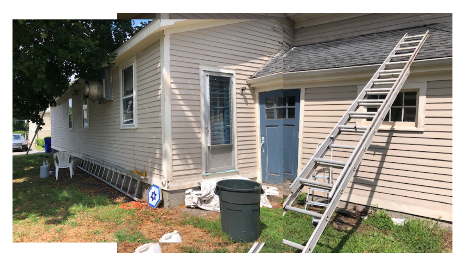
Painting in last phases toward back of TBT.