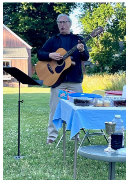
Snaps from Spring 2022 annual meeting and late June outdoor shabbat.